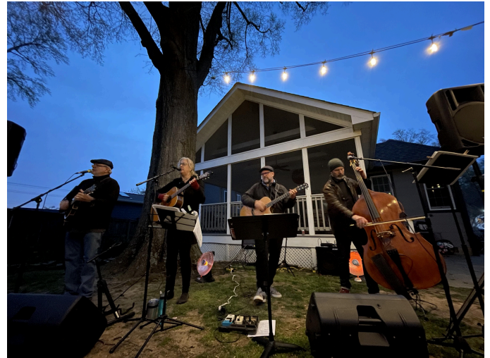
The DC/Arlington-based Celtic band Ardmore plays a Backyard Concert in 2023.

For the fourth year, we will be hosting a series of Saturday concerts in our backyard at 1616 S. Pollard Street. These are open to all neighbors and friends (and their friends and neighbors). Musicians are all local or Virginia-based. We ask for donations for the musicians, but welcome everyone. These events are meant to build community and support some very talented performers. Please join us.